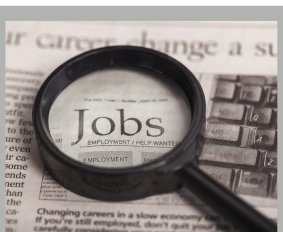
Jobs in Delaware