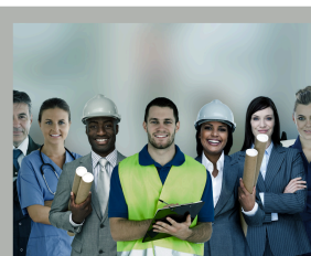
In Demand Jobs