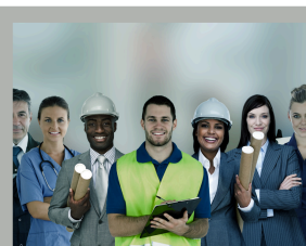
In Demand Jobs

Ohio Bureau of Labor Market Information (LMI) released it's first newsletter summer 2024.