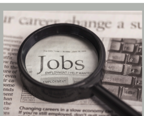
Jobs in Delaware