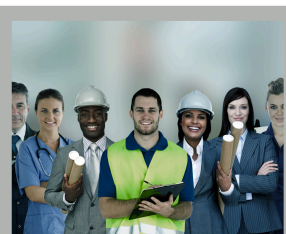
In Demand Jobs

Bonds for Jobs - Reduce Hiring Risks by Breaking Down Barriers