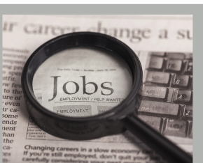
Jobs in Delaware