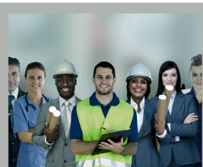
In Demand Jobs