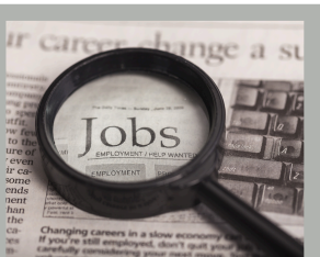
Jobs in Delaware